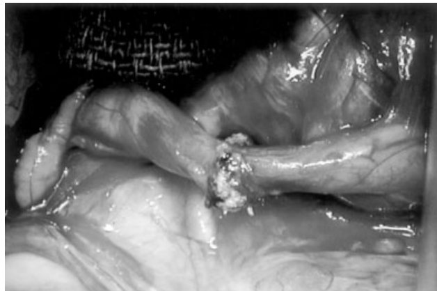
Fig. 2. An anastomosis of ureter was completed using intraluminal albumin stent with laser.

Heart rate, blood pressure, oxygen saturation, and carbon dioxide partial pressure were monitored during surgery. The anastomotic time and total laser energy were recorded. After completion of the anastomoses, the intrapelvic pressure was measured again. The bladder was then opened to place bilateral ureteral pigtail stents and an 8 Fr red rubber urethral catheter through the external urethral opening. The urethral catheter and the ureteral stents were cut short and fixed to the perineal skin with 5-0 polyglactin suture. The abdominal incision was closed in layers. The urethral catheters and the ureteral stents were removed respectively at 3 days and 14 days post-operatively. No drainage tubes were placed at the external site of the ureter anastomosis. Antibiotics (Gentamycin 4 mg/kg, Polyflex 5 mg/kg, twice a day) were given intramuscularly before surgery and post-operatively for 7 days. At 7 days after surgery, ultrasound sonography was performed to check for urinary extravasation at the anastomotic sites. When evidence of urinary leakage and/or urinoma formation was confirmed by sonography and retrograde ureteropyelography, the animal was euthanized. Blood samples were collected before surgery and at the time of sacrifice for general and renal function analyses. The intrapelvic pressure was measured at 4 weeks just prior to animal sacrifice. The ureteral specimens were harvested for histological examination.